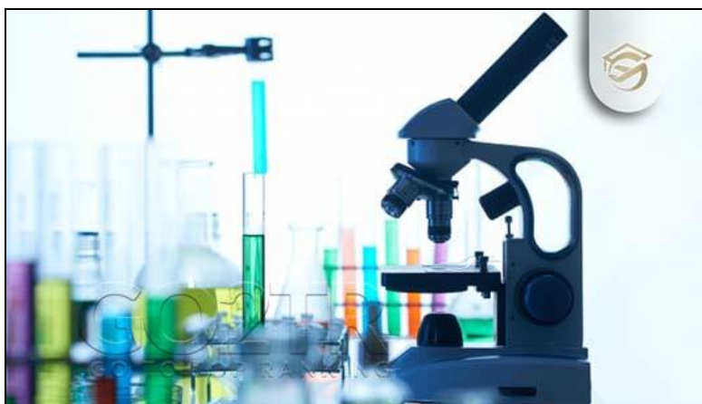
Figure 1. Figure titles (10pt)

Figures: Figures and tables should be kept to a necessary minimum and their information should not be duplicated in the text. Figures must be supplied either as JPEG or TIFF . Photographs and radiological imaging must be high resolution (at least 300 dpi, or higher) and at least 10 x 10 cm large. All figures should be cited in the paper in a consecutive order as: (Figure 1)