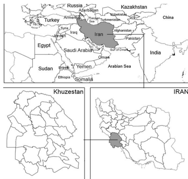
Figure1)Locations of description of study area

km 2 is one of the biggest province in Iran (10-14). The description of study area is presented in Figure1.