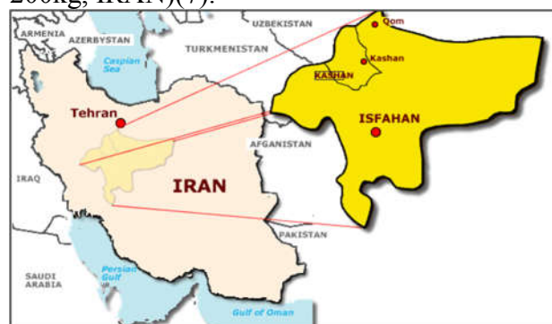
Figure 1) Location of Isfahan City, Iran.

receiving a place, the samples were collected randomly by Bobcat machine (KOMATSU). The waste was mixed completely and was selected one ton of it for analysis. According to Table 1 hazardous waste was separated from the selected sample and their weights were measured by small carriage scales (OHAUS, capacity: 2610, USA) and big carriage scales (Fixed measure, precision: 50 g, capacity: 200kg, IRAN)(7).