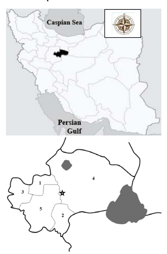
Figure 1) Map of Iran, highlighting the position of Qom Province and its five districts: 1. Jafarabad, 2. Kahak, 3. Khalajestan, 4. Markazi, and 5. Salafchegan (Qom Province)

The annual rainfall was 86.9 mm and relative humidity was ranged between 8.5 in June and 89.1 percent in December.